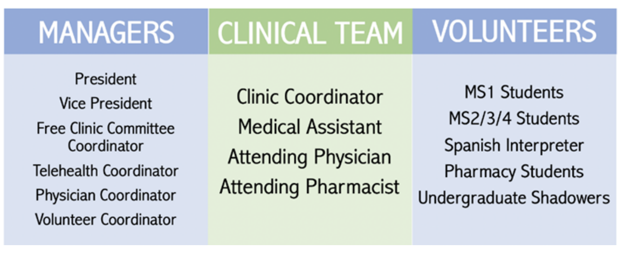
Figure 1. The clinical care team involved in patient care at Agape.

user-friendly interface and Teams was accessible to everyone at UTSW; the two platforms also overlaid compatibly and were therefore chosen initially. The clinic managers connected with volunteers and attending physicians through Microsoft Teams and each patient's care team utilized separate Teams rooms (Figure 1). While the clinical care team connected via Teams, they connected with patients through Doximity. Refer to Figure 2 for a clinic workflow using Teams and Doximity.